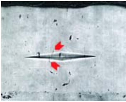
Figure 3. 800X Magnification, Unetched