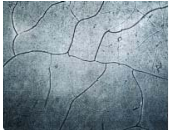
Figure 2. 400X Magnification

Figure 1 is a high magnification photomicrograph of the surface of a panel of AISI 304 stainless steel coated with LFC to illustrate the fineness of the microcracks that are characteristic of this coating. This compares to Figure 2, which is a photomicrograph of the surface of a conventional chromium coating. It is the fineness of these microcracks, which also affords LFC its improved corrosion resistance over conventional chromium by providing a more discontinuous path from the outer surface of the coating to the inner for invading fluids.