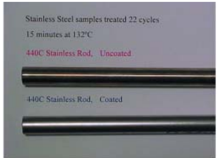
Figure 5, Actual Size

Figure 5. Photograph of the type 440C stainless steel rods that had been subject to autoclave sterilization for 22 cycles at 132°C (270°F). The upper rod is uncoated 440C and has developed a yellowish hue. The lower rod has been coated with low friction chromium and still retains its satin-gray luster.