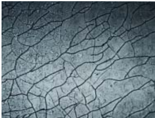
Figure 1. 400 X Magnification

Although high hardness and excellent wear resistance are two of the hallmarks of low friction chromium (LFC), the feature which completes the bridge to its acceptance as a coating for use in medical instruments is its inherent passivity in many types of chemical environments. It has long been known that a self-healing oxide layer of chromium can be formed simply by its exposure to air or by immersion in room temperature oxidizing acids.